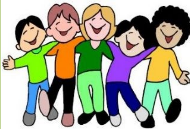
Building bridges; opening doors